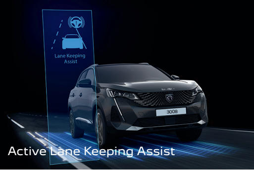
Active Lane Keeping Assist