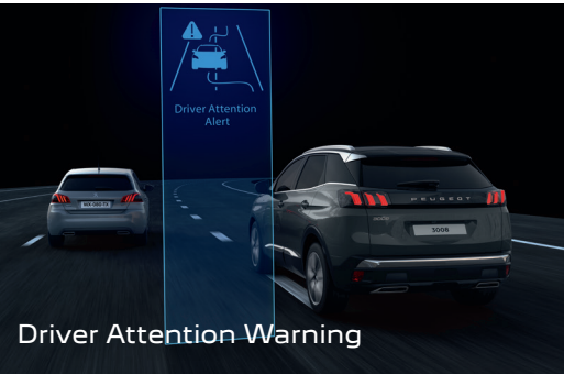
Driver Attention Warning