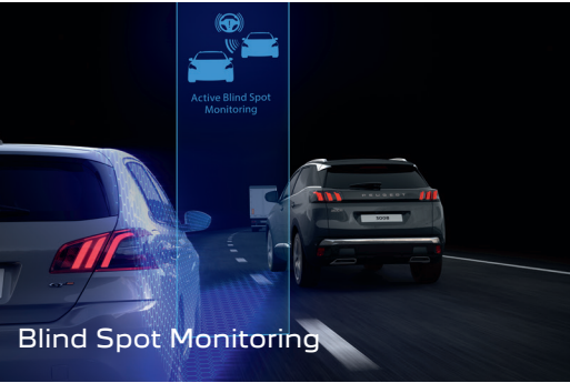
Blind Spot Monitoring