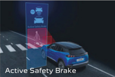
Active Safety Brake