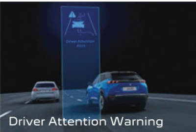
Driver Attention Warning