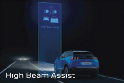
High Beam Assist

Comfort and safety in the all-new PEUGEOT 2008 are enhanced further with the numerous latest-generation driving assistance systems such as High Beam Assist, Blind Spot Monitoring, Active Lane Keeping Assist, Active Safety Brake, and Driver Attention Warning.