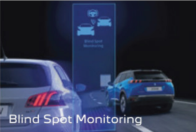
Blind Spot Monitoring