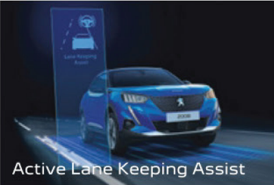
Active Lane Keeping Assist