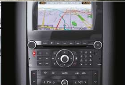
Piano black finish central console