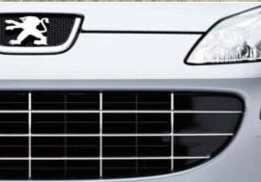
Sporty chrome front grill